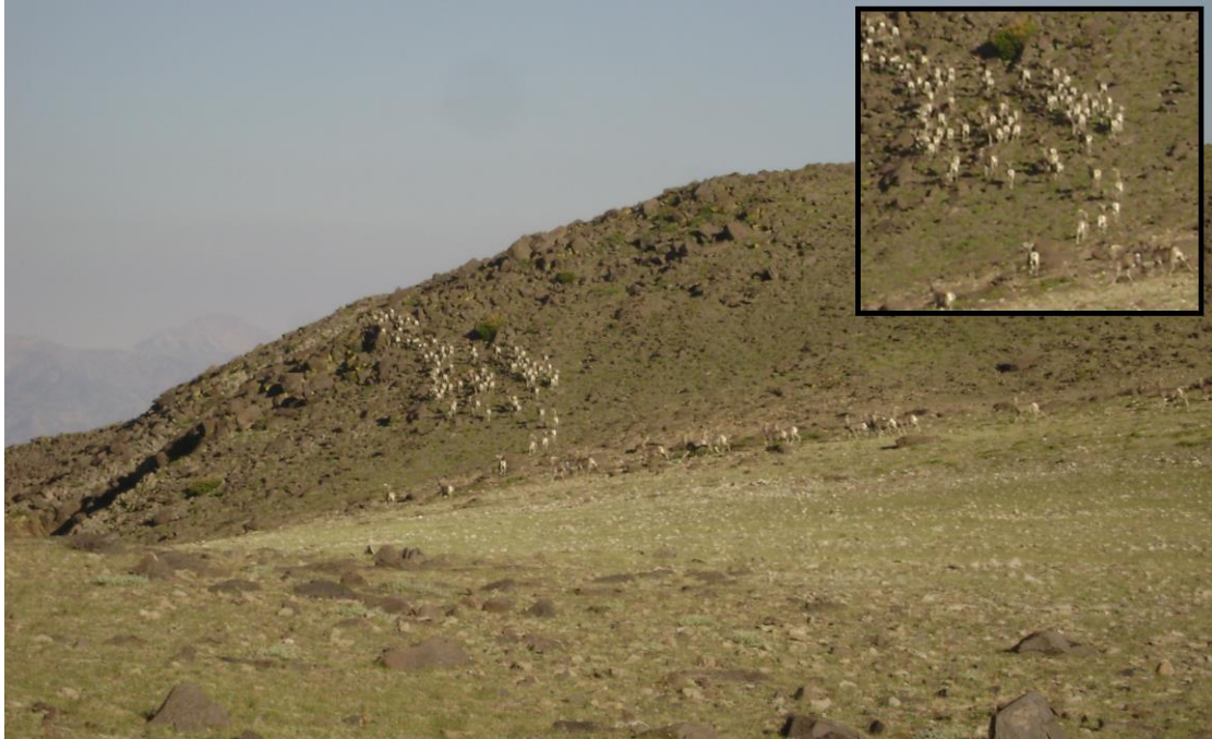
Big Horn Sheep – I counted exactly 100 of them!