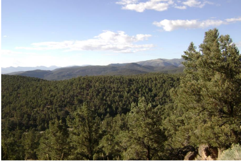
Forest of Utah Juniper and Single-leaf Pinyon Pine on way to village