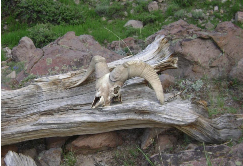
Big Horn Sheep skull – one that didn't get away