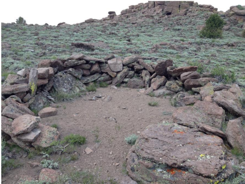
One of the village structures