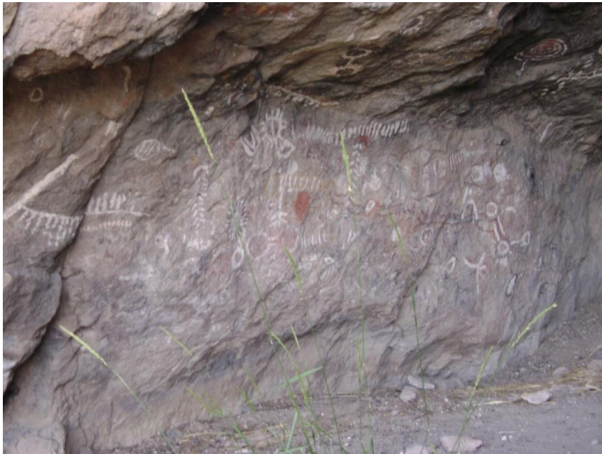
Petroglyphs near village