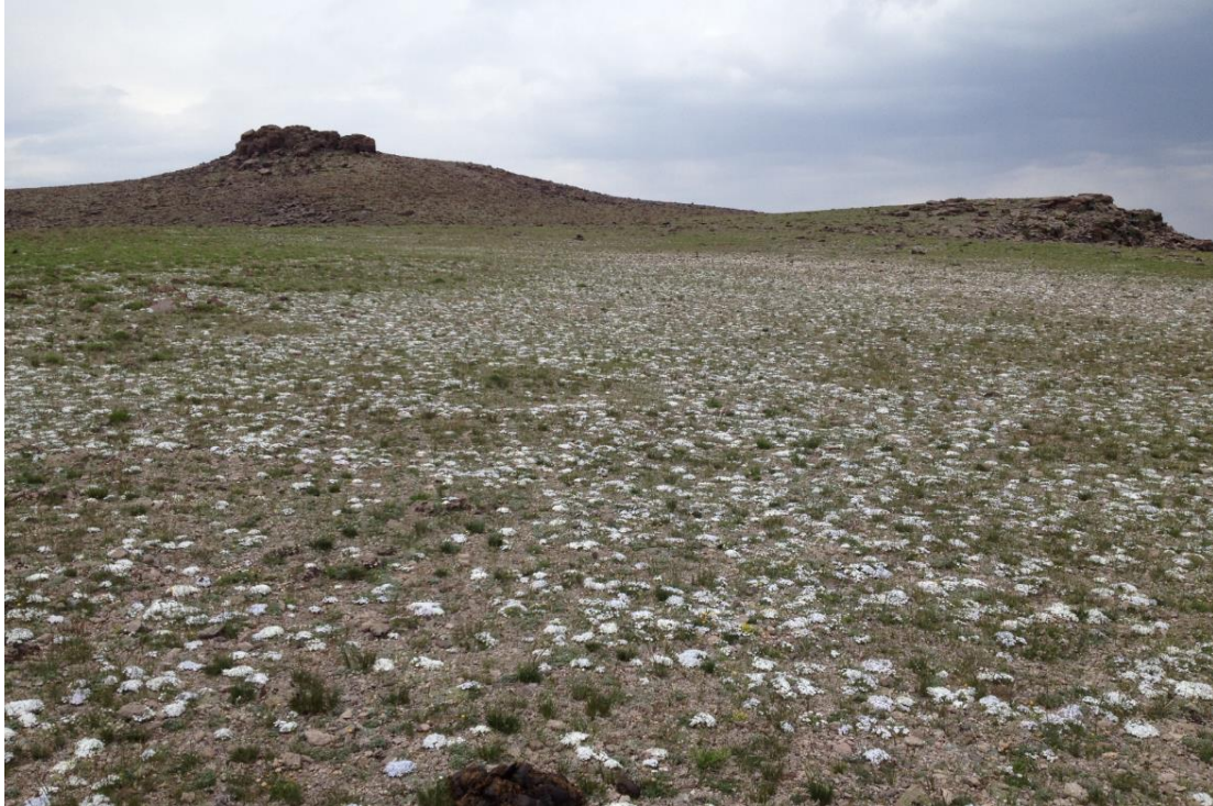
Meadow of flowers