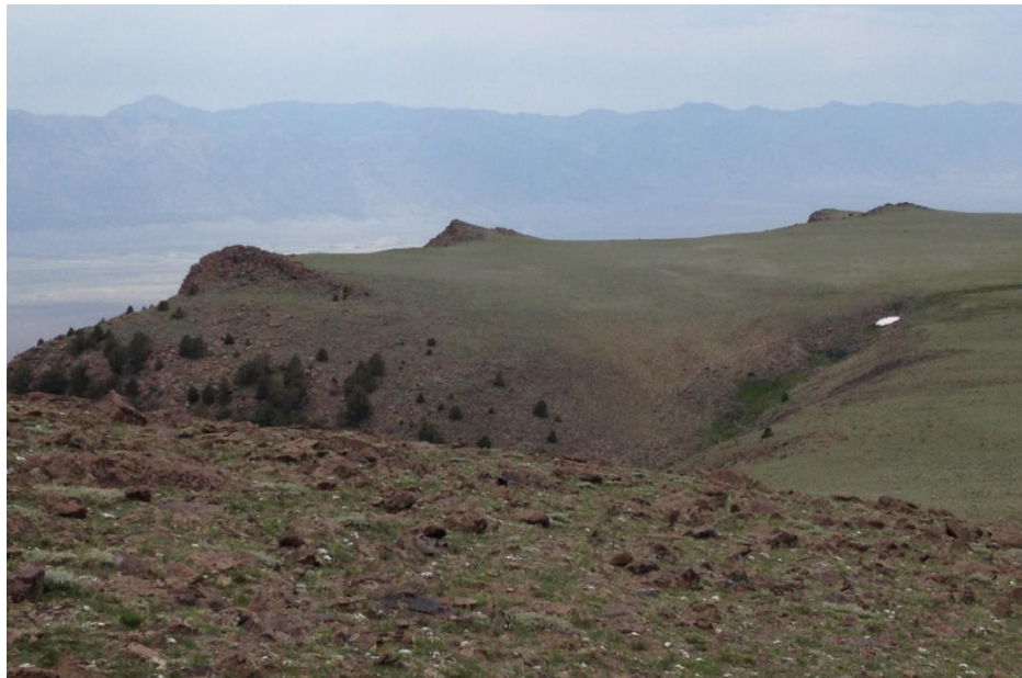
General Location of the village located at 11,000 feet elevation. It is at the head of a small spring and creek. They village occupants probably took advantage of the limber pine nuts that were found just down the canyon from the village.