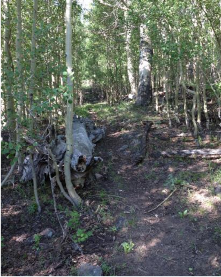
Quaking Aspens on the trail to the site