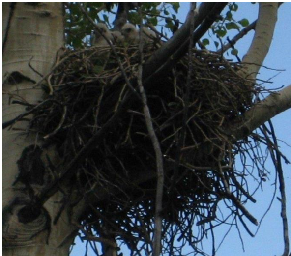
A bird's nest with chicks. I didn't see the mother, which perhaps was an eagle.