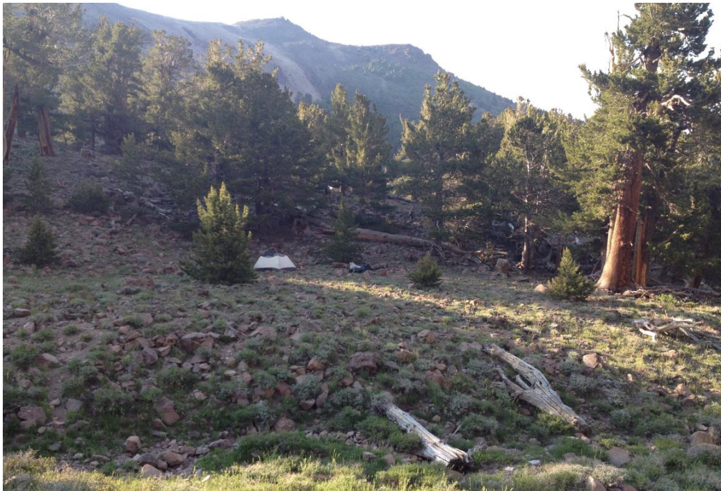
My campsite among limber pines