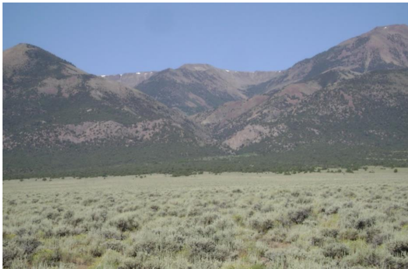
On road the Pine Creek trailhead that led to the village