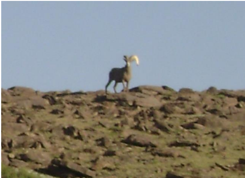
This guy watched me as all of his flock made it safely over the ridge. When the last one made it over the ridge he calmly and royally joined his flock.