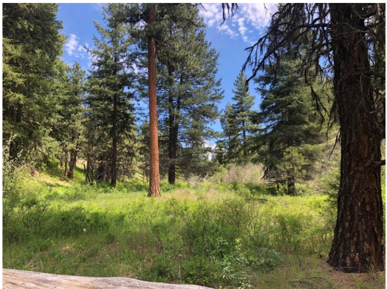
A representative bottom-of-the-canyon picture