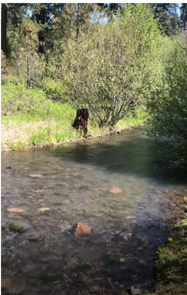
One of the many stream crossings

The Twin Pillars Trail leaves from Wildcat Campground follows the East Fork of Mill Creek for nearly three miles before it splits into two trails. The north trail goes toward the Twin Pillars which is a volcanic plug that is sometimes ascended by climbers. The south trail climbs to Wildcat Mountain. That first stretch along the creek must be crossed several times without the benefit of a bridge. Unless it is late summer, where you might be able to cross dry-footed, I would recommend old tennis shoes to walk through the shallow creek as I did in mid-summer.