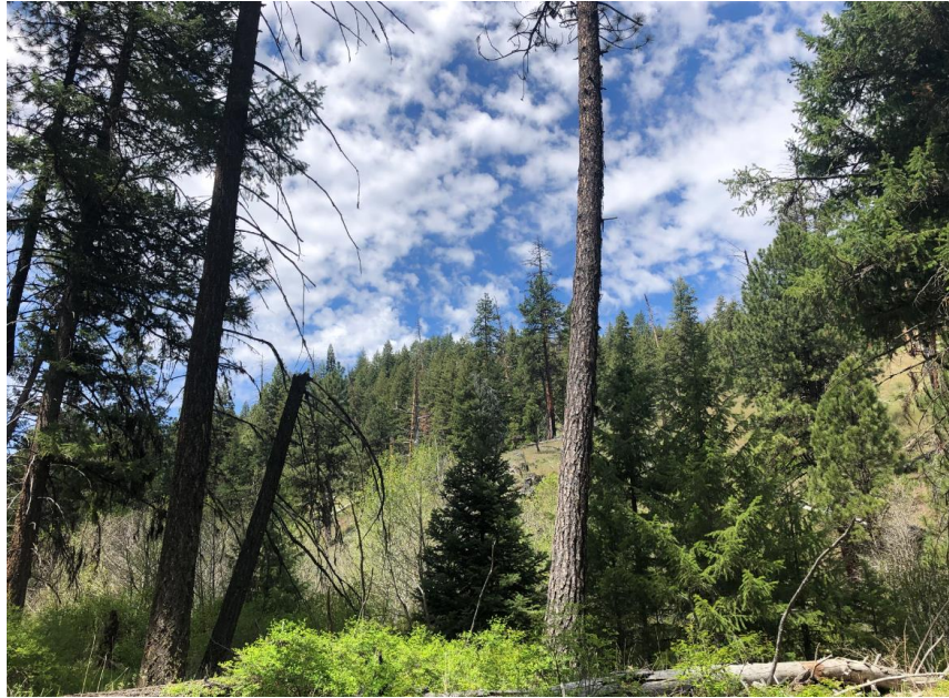
A typical up-slope view with Douglas-fir, grand fir and a few ponderosa pine