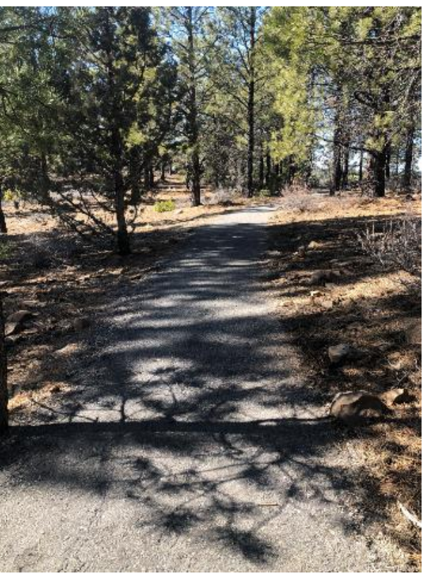
The nice Whychus Overlook Trail (the canyon part of the trail is dirt and rock)