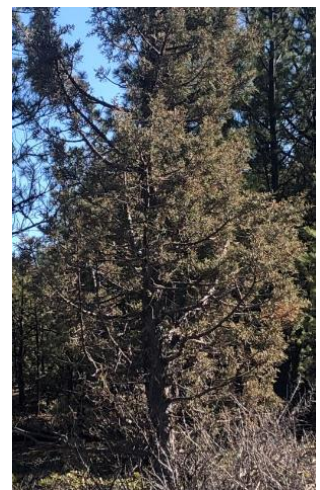
The ubiquitous western juniper