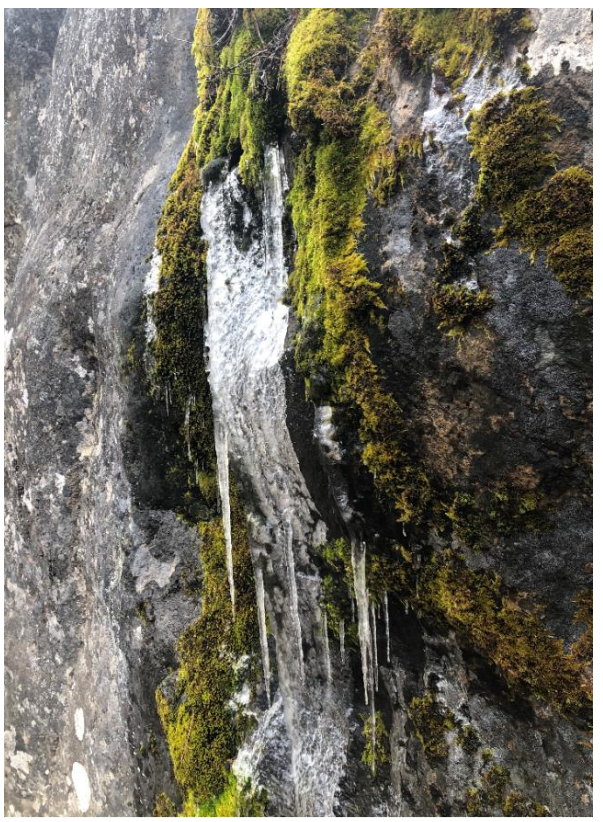
One of the many mossy rocks near the stream - with little icicles