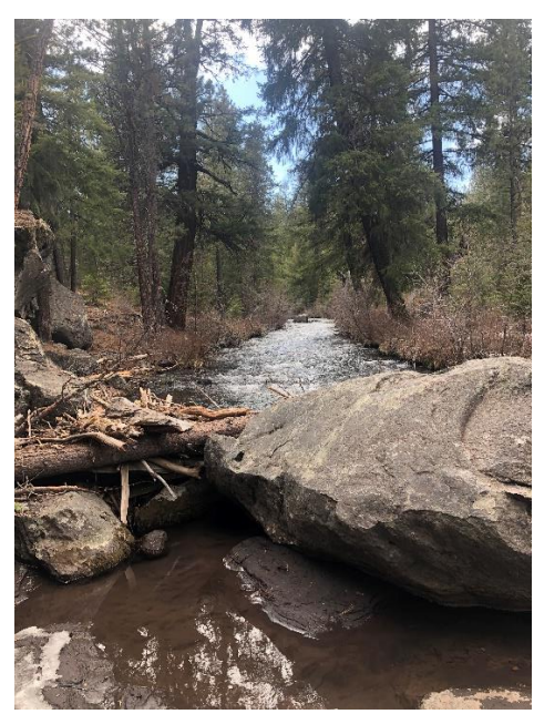
Another view showing one of the many log jams (there was a fire upstream not long ago)