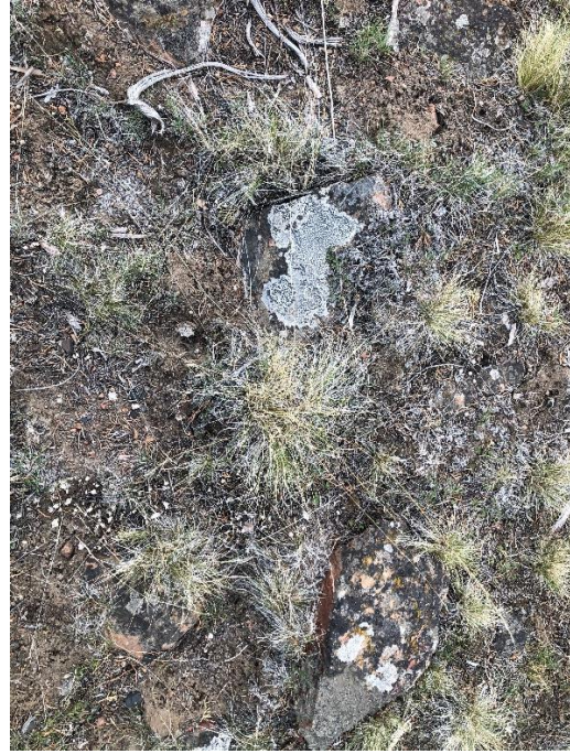
Some native grasses and lichen