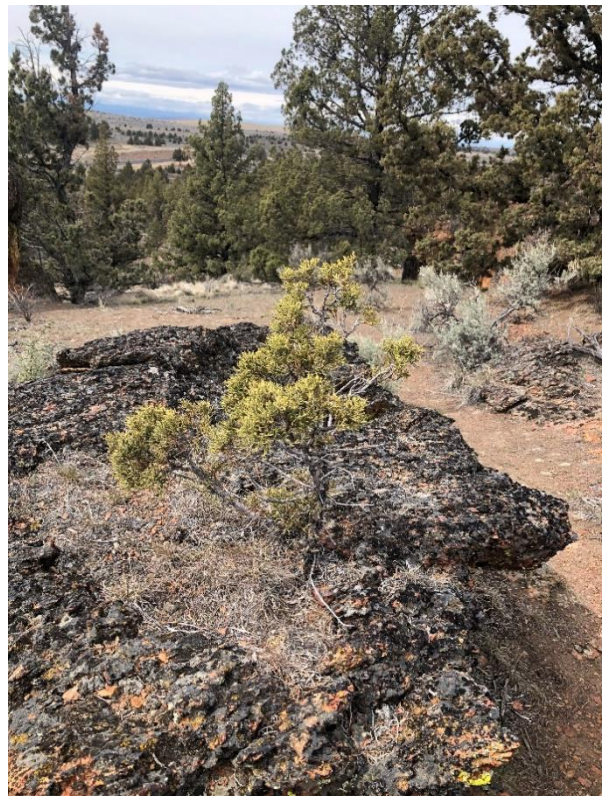
The tenacity of this western juniper to hang in there!