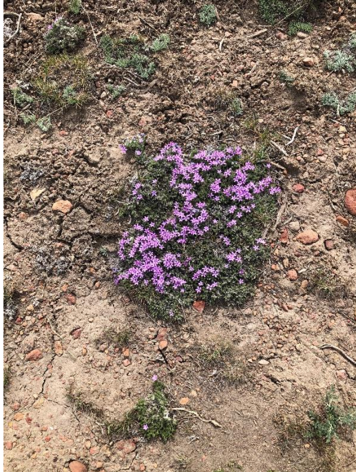
An unidentified flower