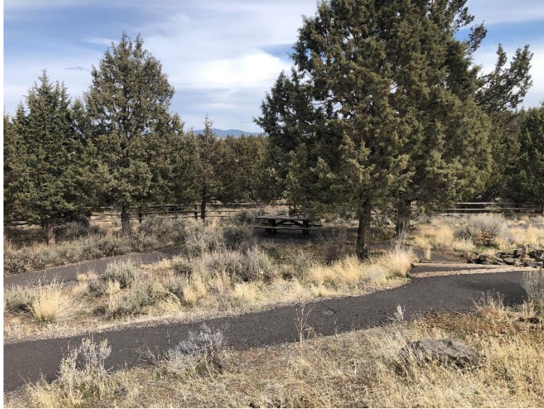
Small picnic area at entrance