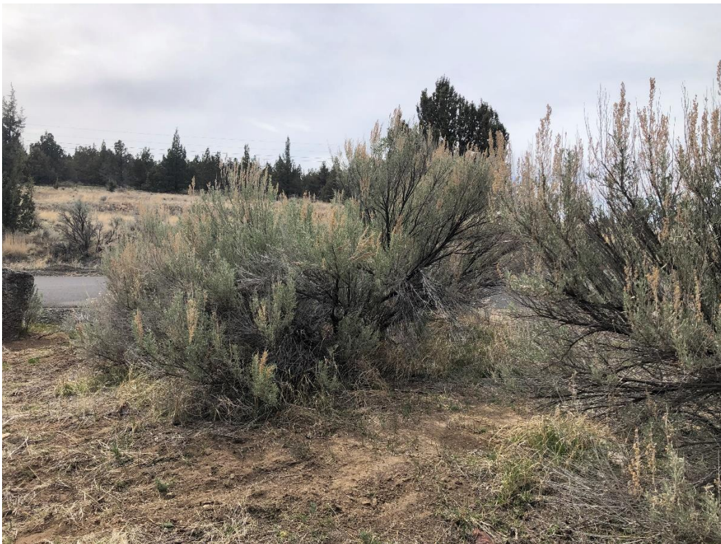
A few of the giant sagebrush plants, which are common in the area