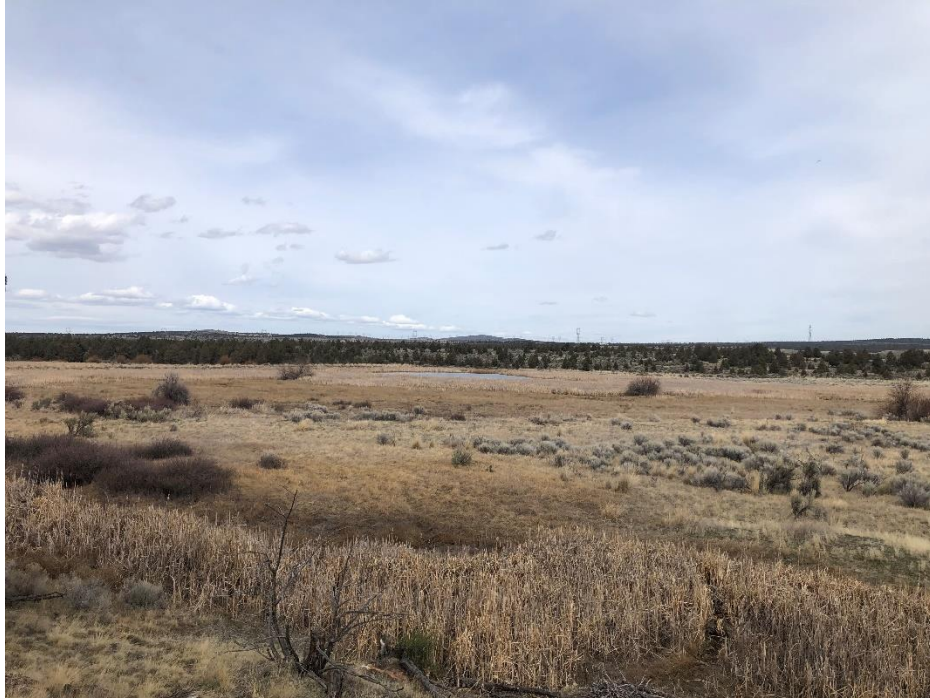
The small lake on the east side of the area