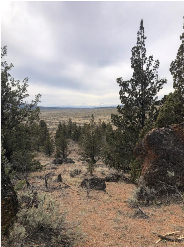
View from small bluff on south side (the western junipers were the only trees in the area)