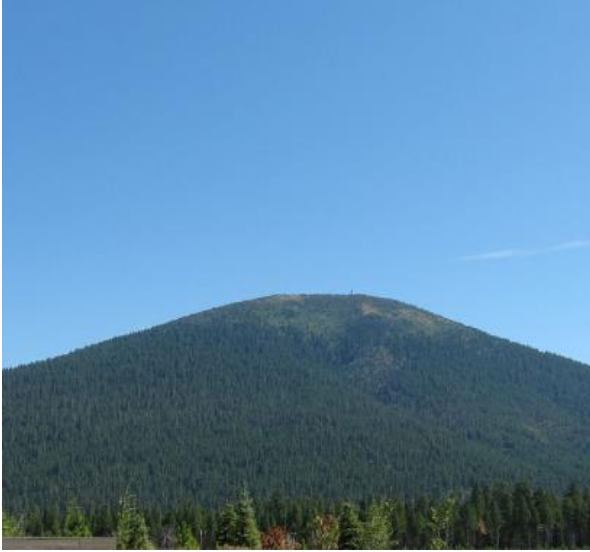
Black Butte from near Sisters, Oregon