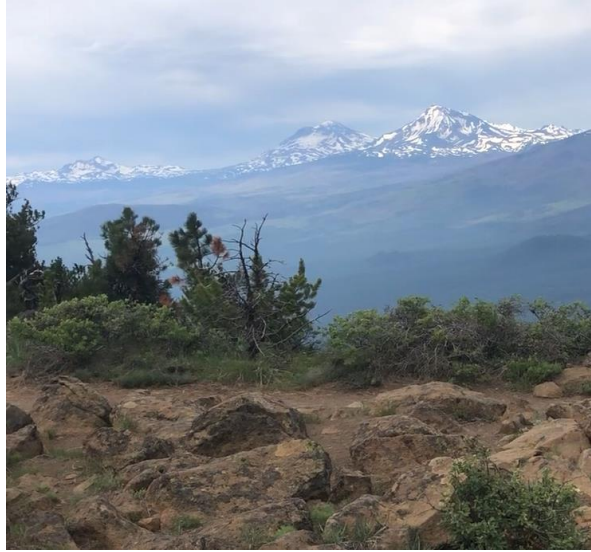
The Cascades to the west