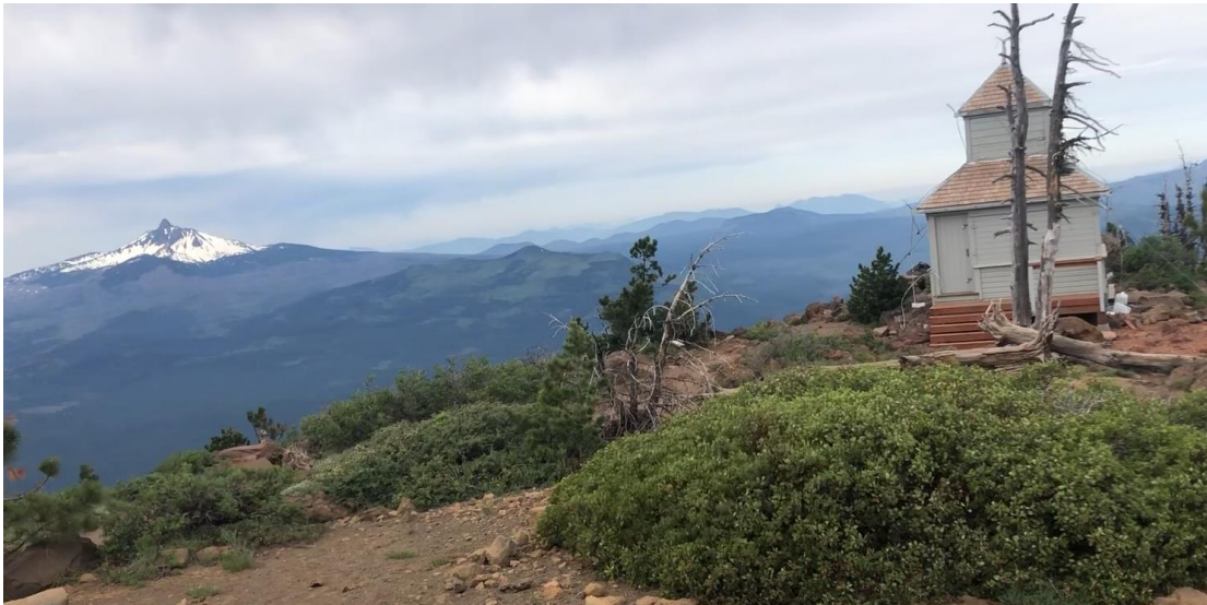
A log cabin residence for the lookout crew and the Cascades

There are a few structures on the top, a cabin that can house the summer lookout tower staff, and the tall lookout structure itself. The view from the top is spectacular as you would imagine from this tall butte. It can get windy up there unless you can tuck yourself behind some of the volcanic rocks scattered around the top. And snow can persist into June some years, so plan ahead.