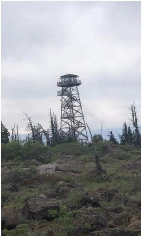
Black Butte fire lookout