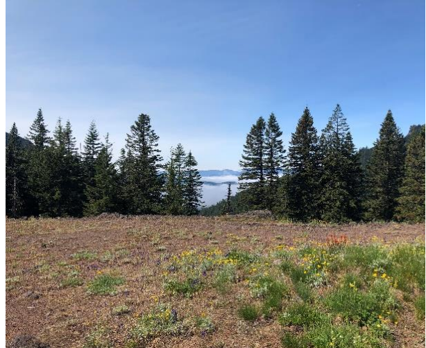
A drier meadow