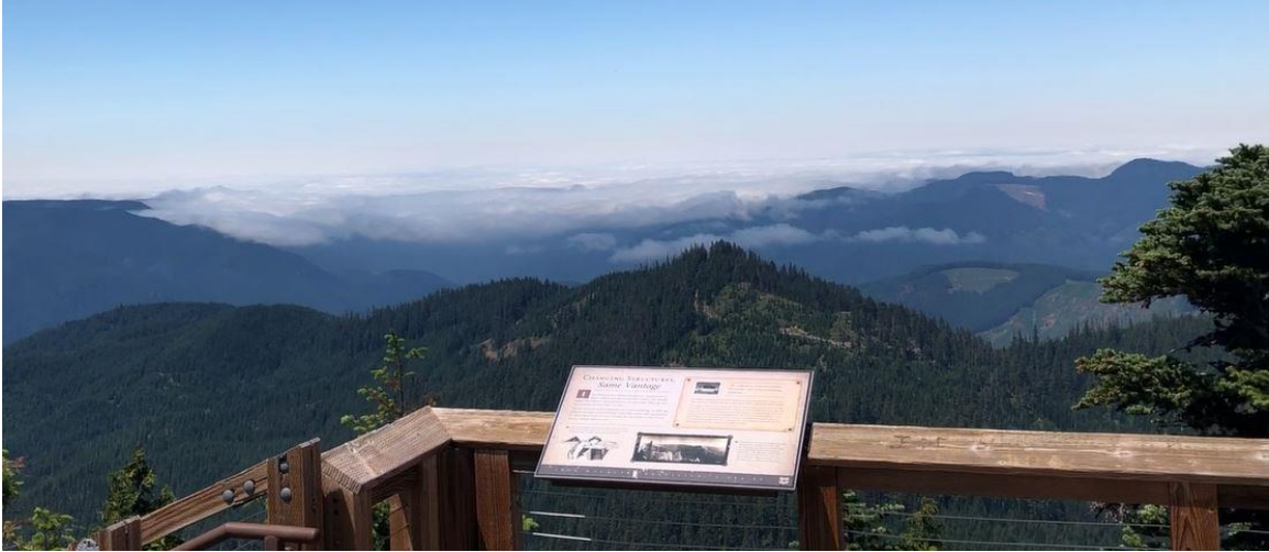
The Willamette Valley to the Southwest from the lookout