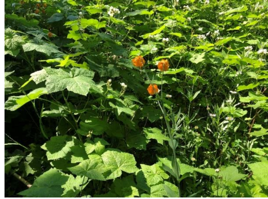
Columbia tiger lily