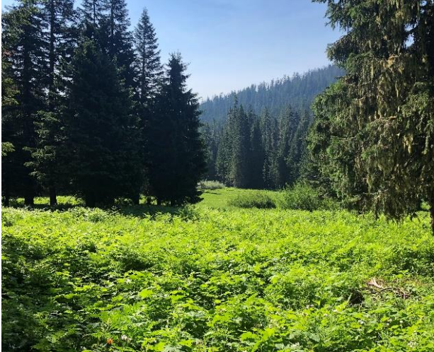
A wetter meadow