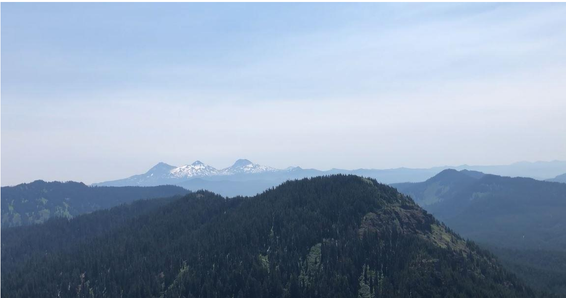
The Three Sisters Mountains to the southeast