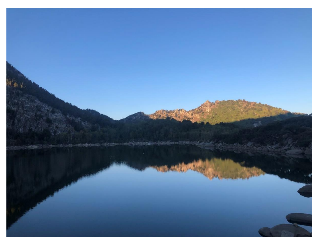
The larger of the Blue Lakes

The trailhead is also a nice campground with a decent pit toilet, but no water. It's a nice reprise from the very long, rugged access road. It has several nice, flat spots and a few picnic tables, and a fantastic view to the west.