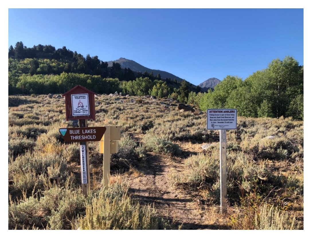
The start of the trail