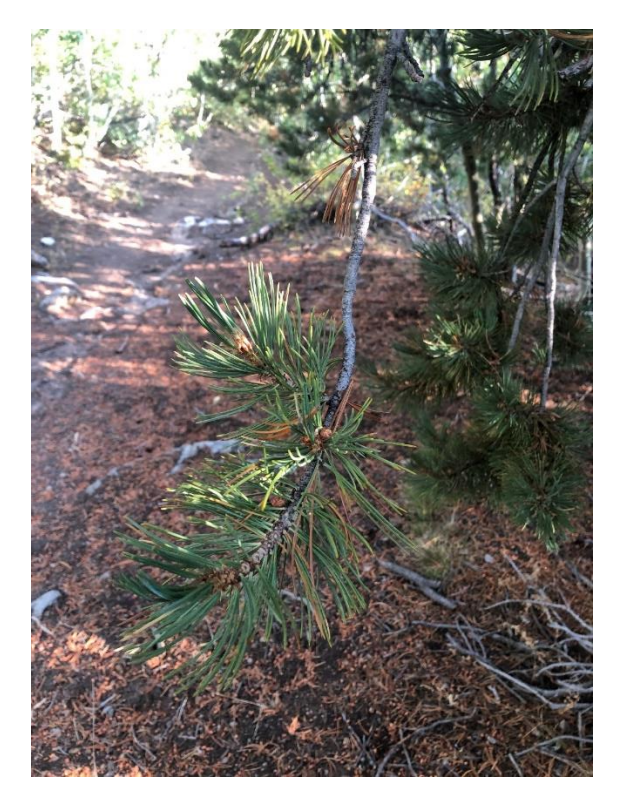
Whitebark pine along the trail