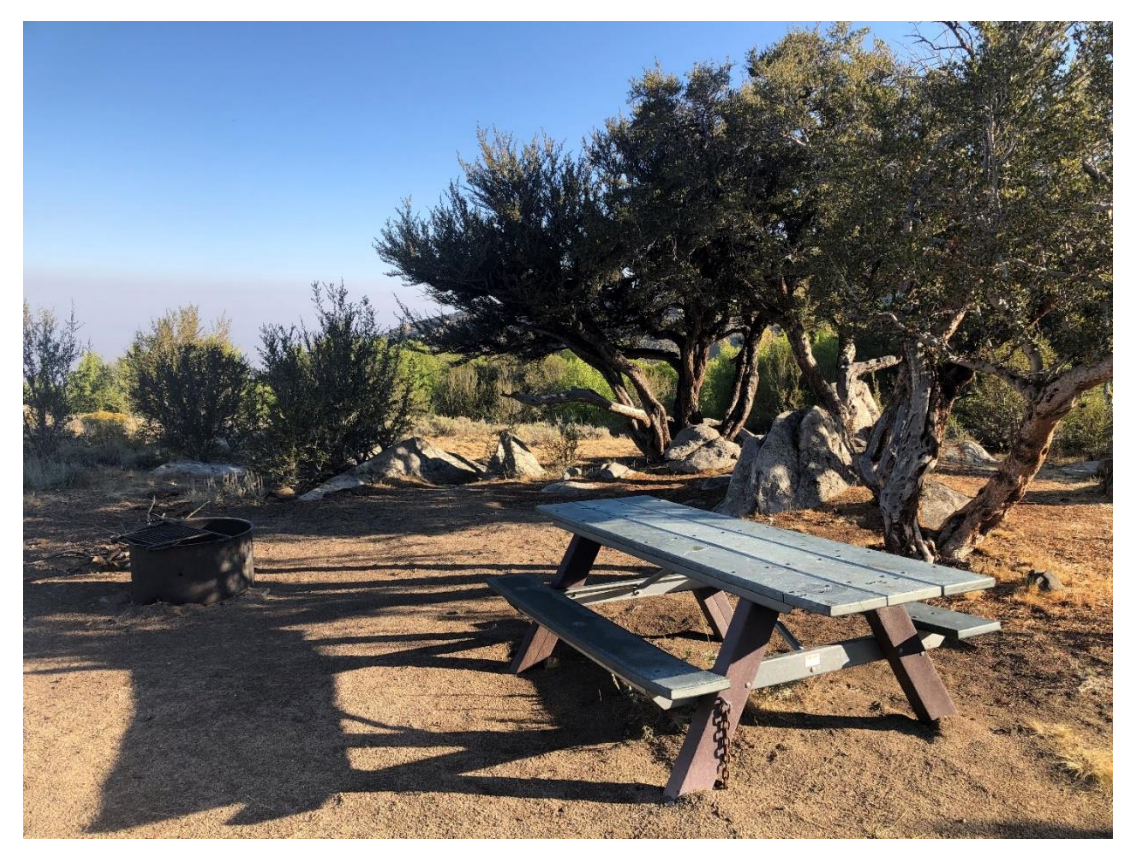
One of the nice campsites at the trailhead