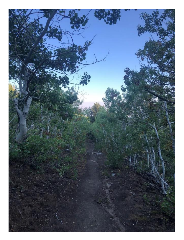
The trail winds through a grove of quaking aspen